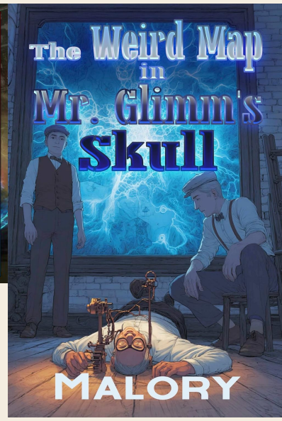
The Weird Map in Mr Glimm's Skull