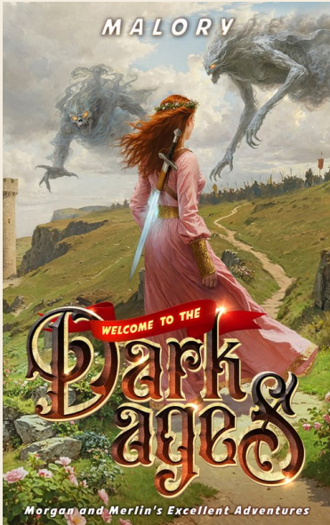
Welcome to the Dark Ages

High-resolution versions available from maloryauthor.com/press.html or by request.