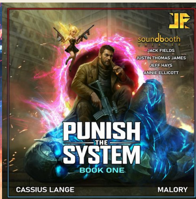
Punish the System